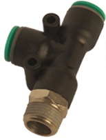
EPD/APD Branch Tee